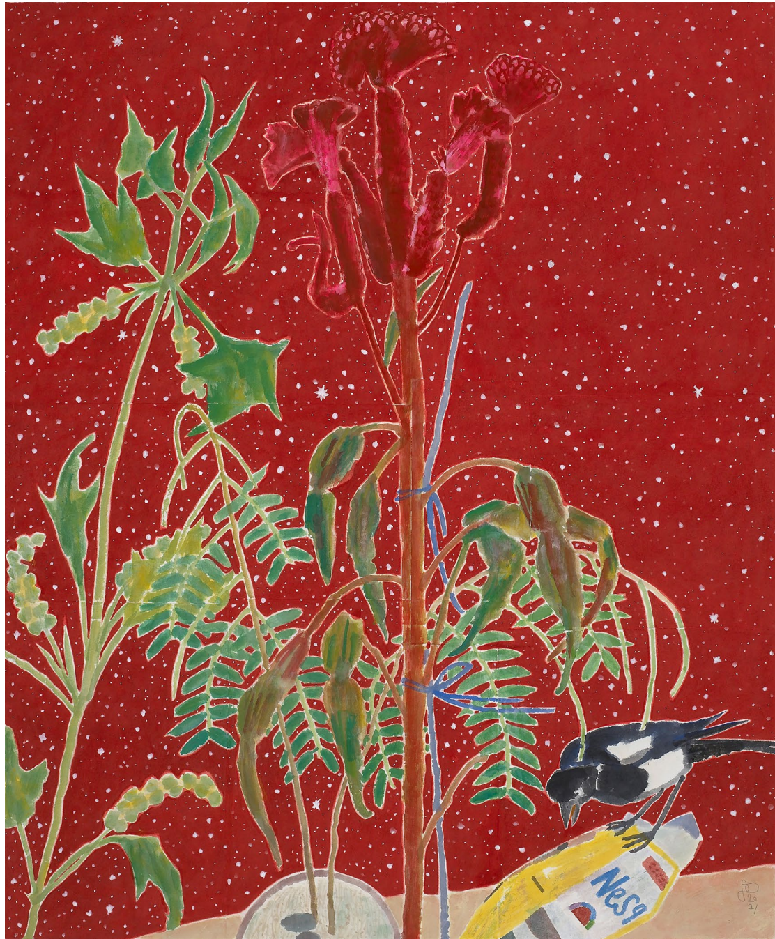
Daytime Stars - Magpie