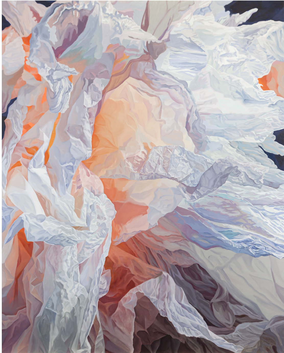
The Origin of Consciousness 1