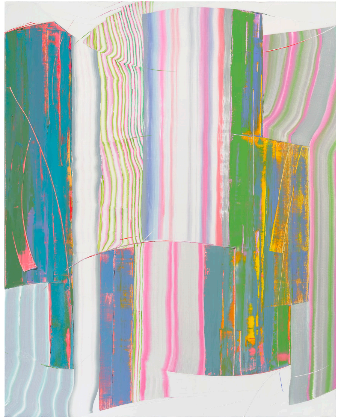
p22075 - Electronic Nostalgia