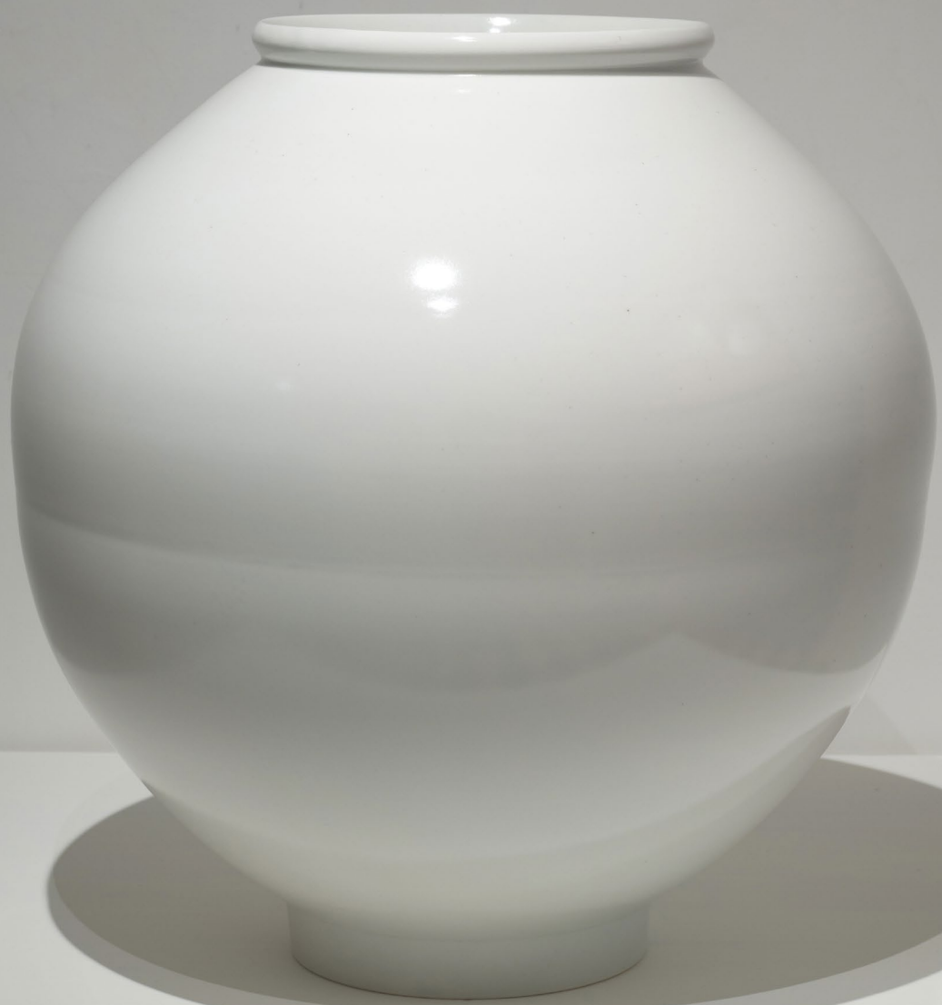
Moon Jar 202409-2