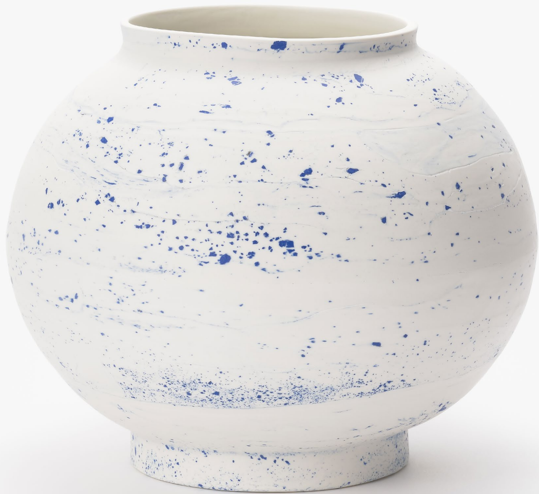
Blue Moon Jar