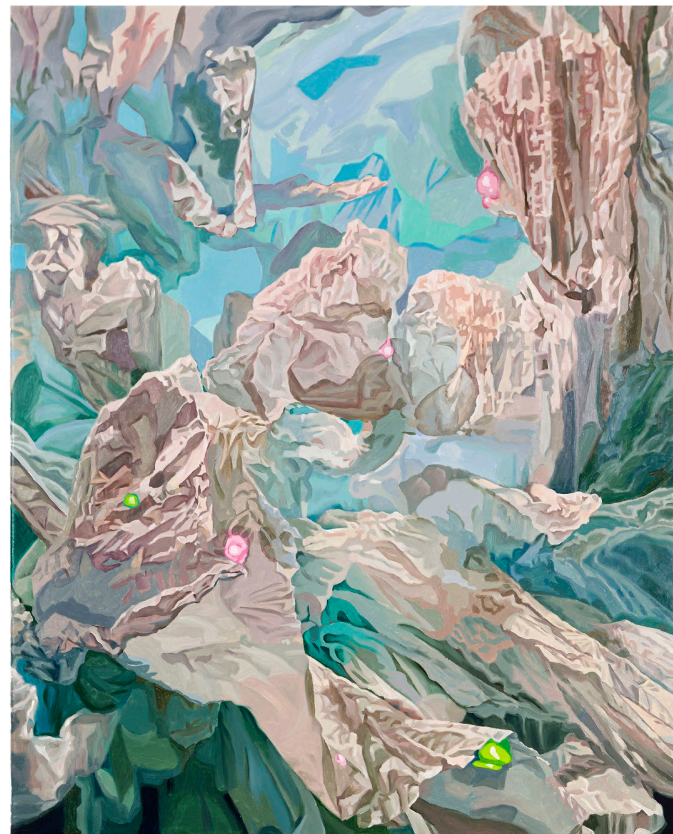
Where Stars are Born 2

2023 Oil on canvas 50 x 40 cm Framed: 53 x 43.5 cm