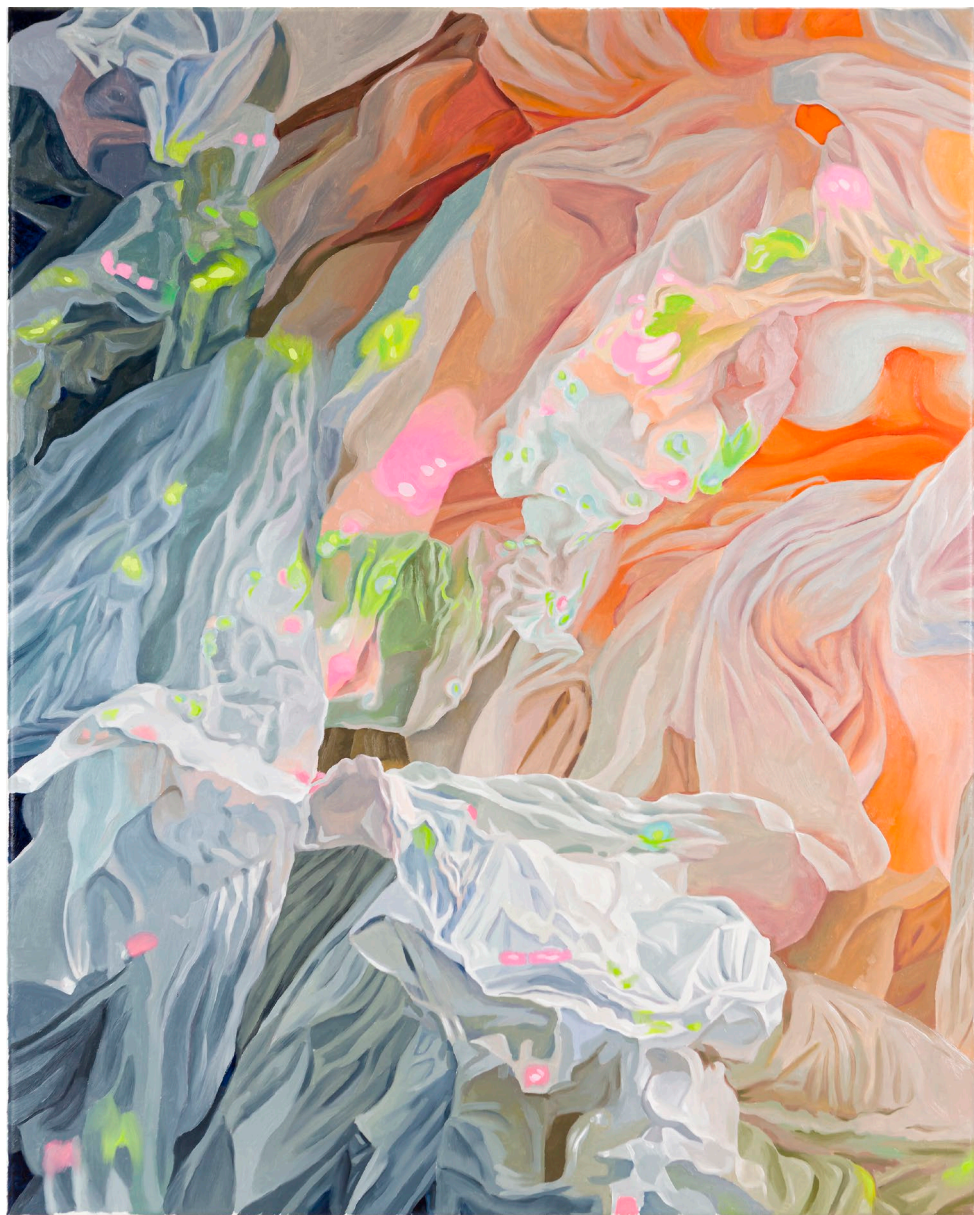
Where Stars are Born 1

2023 Oil on canvas 50 x 40 cm Framed: 53 x 43.5 cm