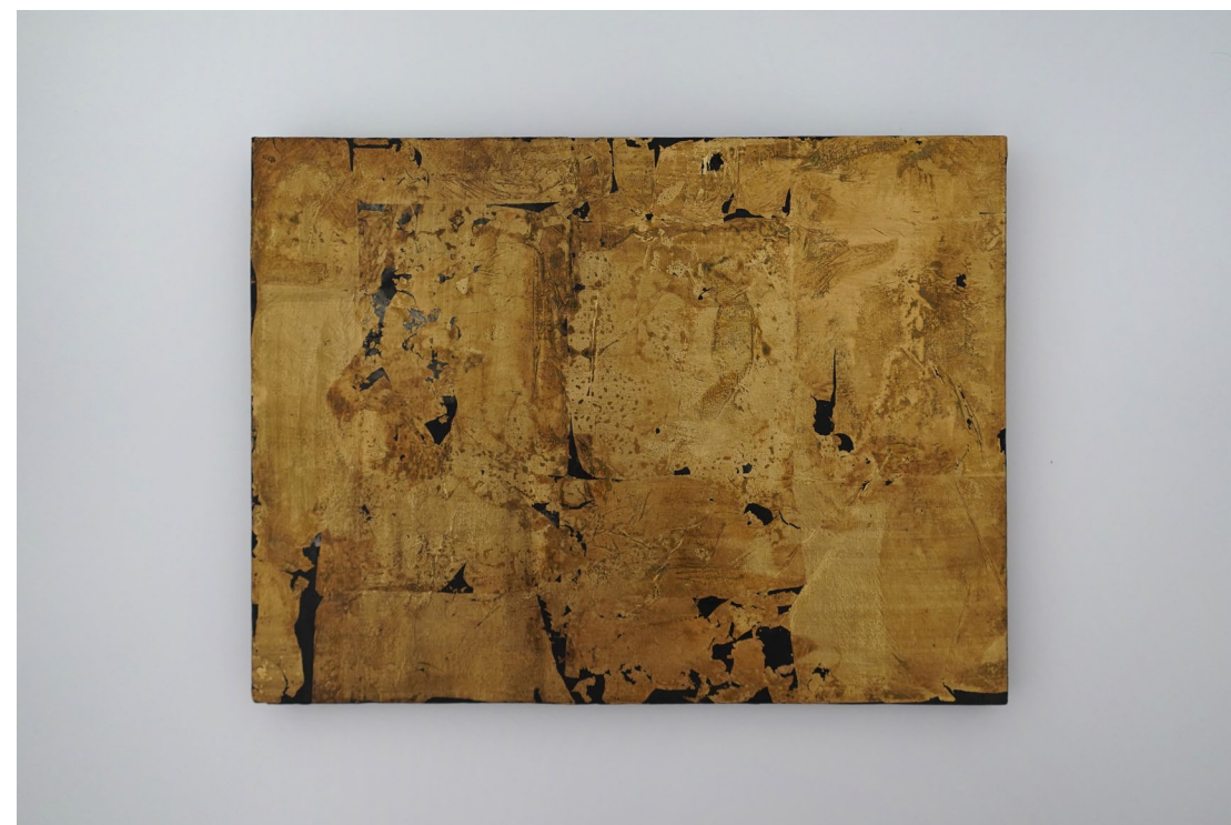
The Light of Absence

2024 Alloy gold leaf and acrylic on found book 16.5 x 24 x 2.3 cm