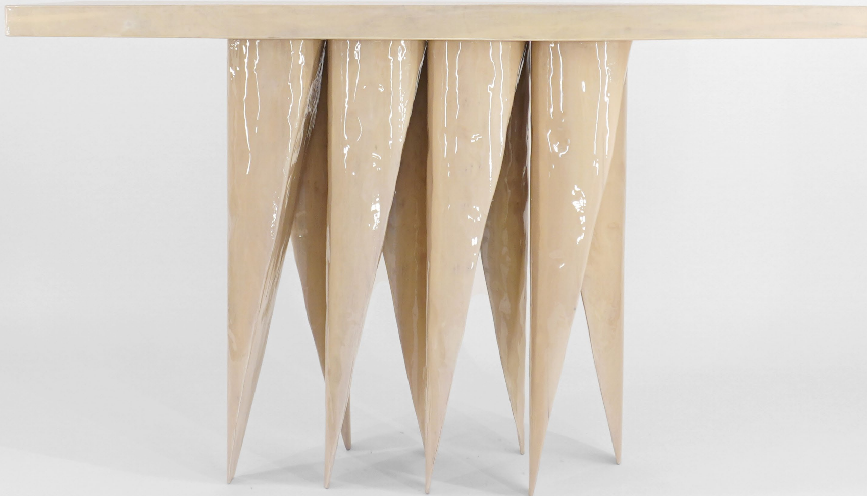
Obeisance Console Table