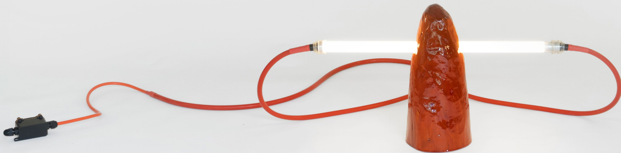
Thumb Table Light