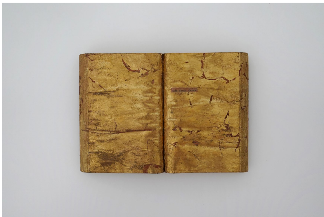
Ayla Devait Choisir (Ayla had to choose)

2024 Alloy gold leaf and acrylic on found book 16.5 x 24 x 2.3 cm