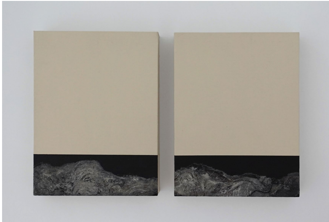
In the Stillness Between Two Waves of the Sea

2024 Monoprint collage and acrylic on wood (Set of 2) 20 x 15 cm, 20 x 15 cm