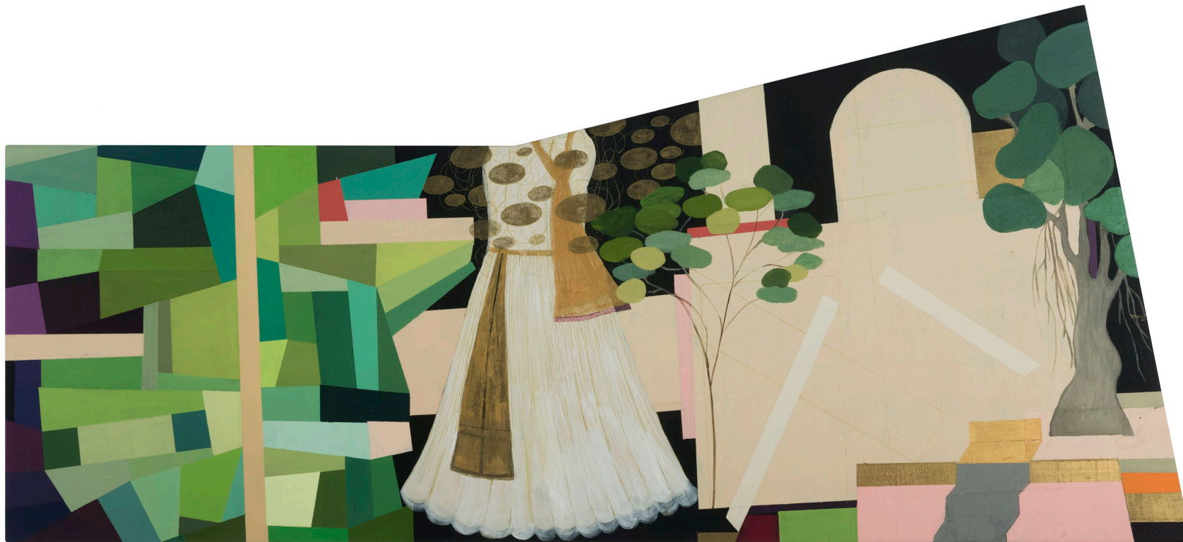
The Place Where You Are