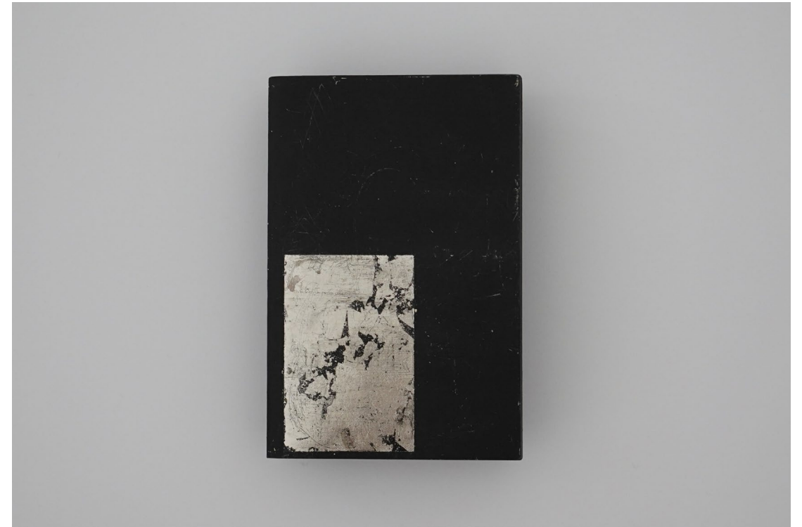
La Nuit Qui Ne Finit Pas (The Night that never Ends)

2024 Monoprint collage and acrylic on wood (Set of 2) 20 x 15 cm, 20 x 15 cm