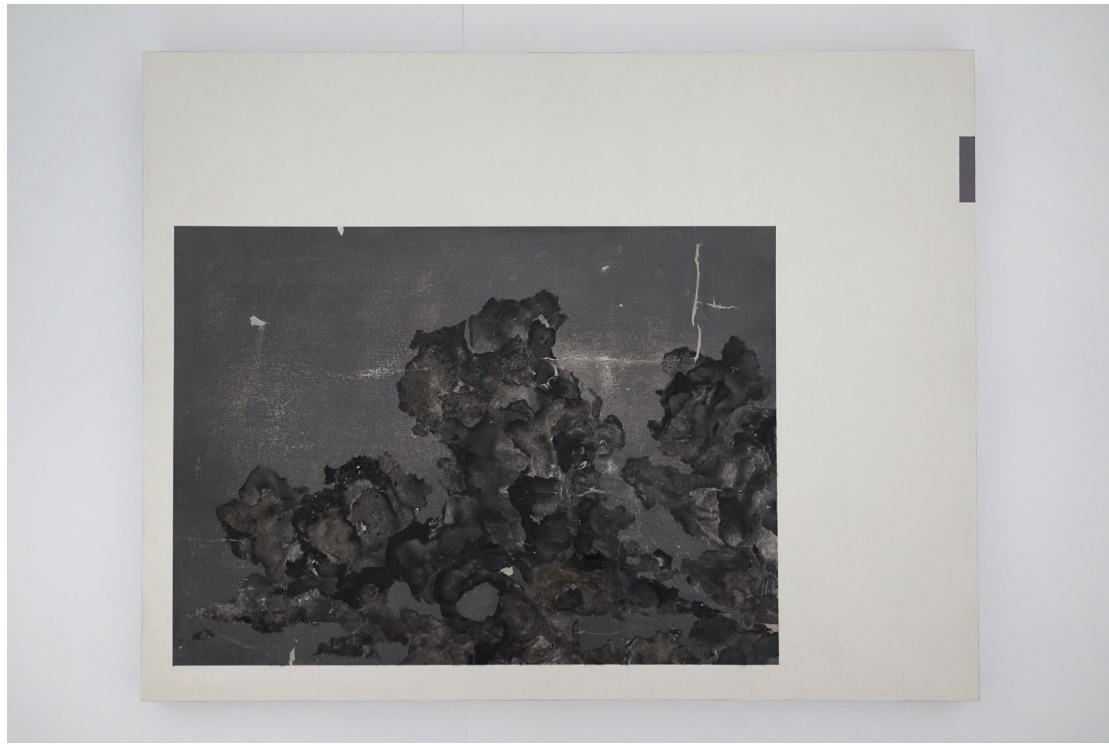
A Silent Night, Elsewhere

2024 Monoprint collage and acrylic on wood 50 x 65 cm